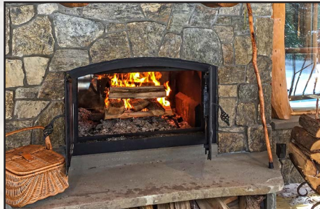
Hearthroom 36 IO

Available in three viewing widths: 36, 44 and 48; arched or rectangular front and doors, standard black finish, thermostatically controlled blower(s) & variable speed control.