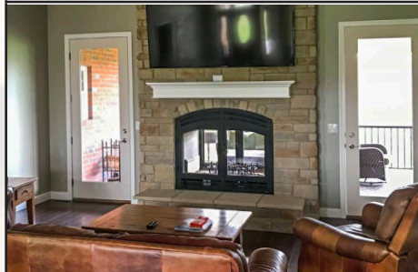
Hearthroom 44 IO