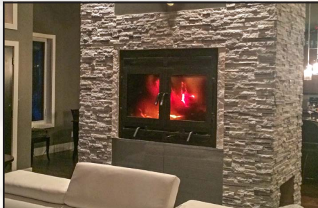
Hearthroom 36 ST

Available in three viewing widths: 36, 44 and 48; arched or rectangular front and doors, standard black finish, thermostatically controlled blower(s) & variable speed control.