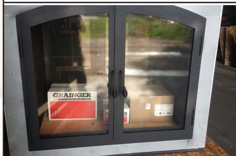
Hearthroom 48 IO