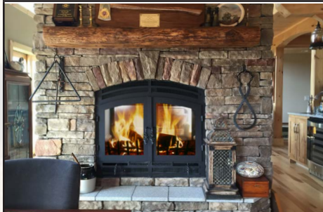
Hearthroom 44 ST